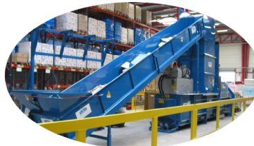
OPTION: CONVEYOR BELT