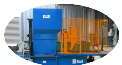
OPTION: BIN LIFTER

We reserve the right to make changes to specifications without prior notice. Bale weights are dependent upon material type.