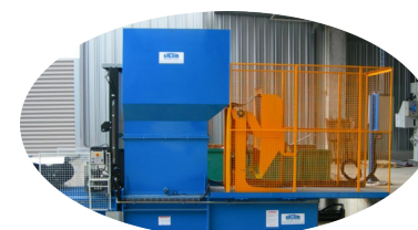
OPTION: BIN LIFTER

We reserve the right to make changes to specifications without prior notice. Bale weights are dependent upon material type.