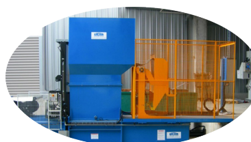
OPTION: BIN LIFTER

We reserve the right to make changes to specifications without prior notice. Bale weights are dependent upon material type.